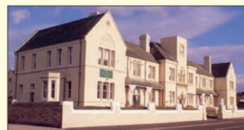
CIU SALT BURN HOUSE

It was reported in last month's issue that the Union's holiday and convalescent centre, Saltburn House, on the north Yorkshire coast closed on January 31. The National Executive came to this decision because despite the best efforts of the Head Office and Saltburn House staff it was felt that continued financial losses over a period of many years had made it impossible for the centre to remain open. Total losses in the years from 2008 to 2012 add up to £861,296.