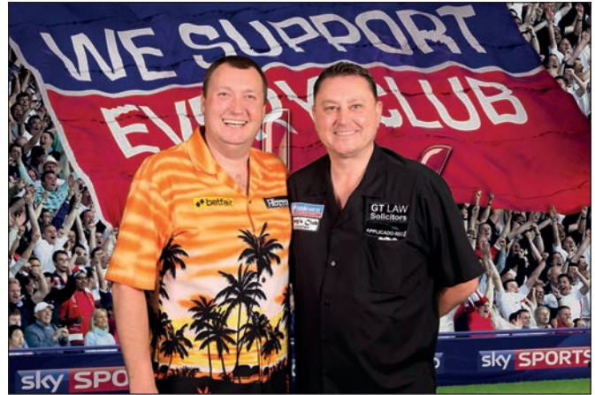
Wayne "Hawaii 501" Mardle and Kevin "The Artist" Painter. No prizes for guessing which is which.

Sky gave guests a unique darts experience with a stunning demo that had guests ducking and diving as the darts came flying at them in 3D. To top things off one lucky guest won the free prize draw and walked away with a 47" LG 3D TV for their club.