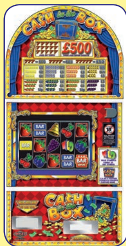
There is no MGD or VAT to pay on B3A machines

More details on this and on the CIU National Quiz, which Dransfields are again sponsoring, on Pages 10 and 11.